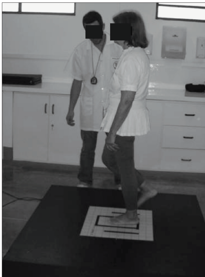
Figure 2. Subject's position on the force platform (model BIOMECH400) during one-leg standing for balance test.

Mean values with standard deviation (SD). a Tshortest: performance score of functional agility/dynamic balance test. Tlimit: performance score from traditional one-leg stance test. Time of force platform: time values from time-series data of force platform, ranging from 0.5 to 30 seconds. *Student's t-test between Tlimit and time values from force platform. No significant difference was found between the two tasks.