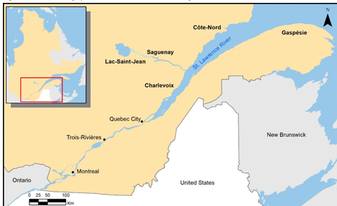
Figure 1 Geographical location of the cities and regions referred to in the text