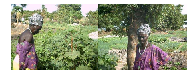
Figure 4. An elderly woman explaining the medicinal virtues of certain plant species.

they are involved daily in the production of tomatoes, onions, lettuce, beets, cucumbers, green beans, mint, parsley, leek and sweet potatoes (Fig. 3). Most of the produce is sold locally and the profits are kept in a women's solidarity fund, which allows them to deal with unforeseen circumstances as necessary. With the funds obtained, they also intend to establish a micro-business to process and package tomato juice and paste, dry mint and parsley, and provide food service for the ecotourism complex.